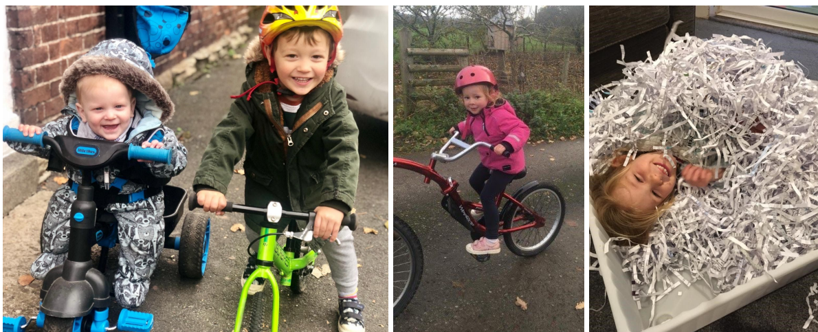
Cycling and recycling!