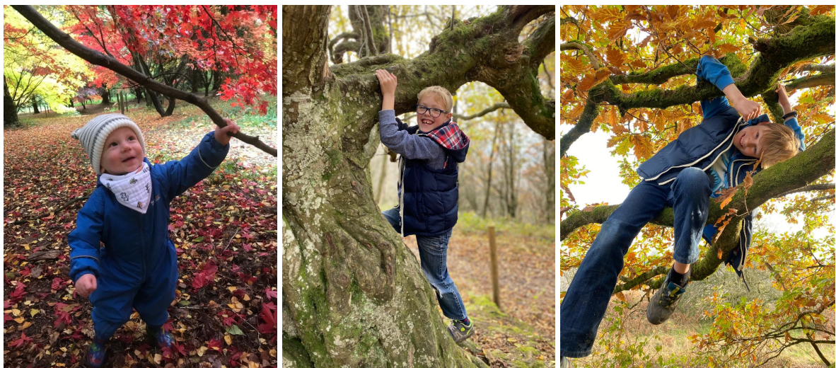
"One day I'll be climbing that high"