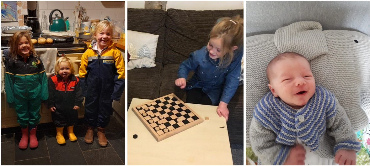
Reasons to smile - bonfire night preparations, winning at draughts and finding that first smile